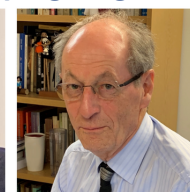
Sir Michael Marmot